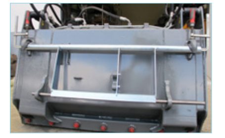
plate's bracket and the spring anchor the hydraulics