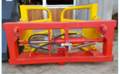
1. fix the assembly jig, weld the floating 2. engage the floating plate, install