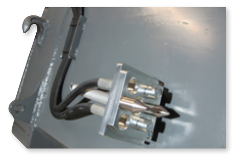
coupling unit on the attachment +