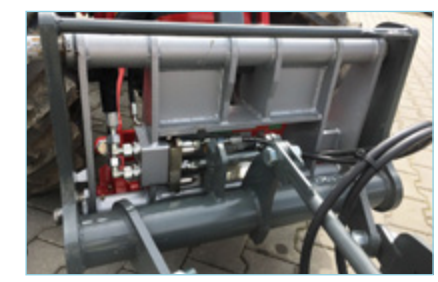
3. couple - done