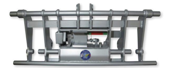
carriage with Highspeed Oil Coupler =